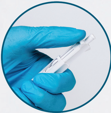
Single hand extension

EndoTNeedle was engineered to balance performance and value while delivering a highly reliable needle for your most tortuous cases. Designed with quality materials, features from premium needles, and a handle your staff will love. The EndoTNeedle is your new everyday needle.