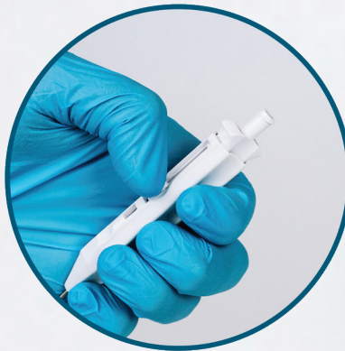
Click to retract